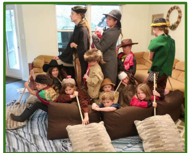
Washington Crossing The Delaware