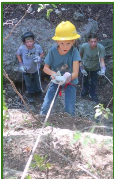
Everyone Loves Rappelling