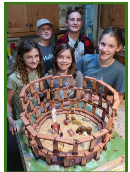
History Class Cookie Colosseum