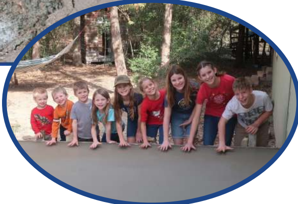
Concrete Kicks Off Deck Project After 5 Years Of Planning

One of our prayer projects has gone like this: For a year we had been petitioning God for justice in the situation with our road. Suddenly the dam broke (or at least, the road washed out) and we had a flood of activity. A call to report the situation was escalated to 911 bringing out emergency vehicles, news reporters and an offer of evacuation. The next day a group of neighbors joined us at Commissioners court to present our case. We brought along a recently finished opinion from a survey professor stating the section of road in question was county property. Our evidence was dismissed as irrelevant. This kicked off five weeks of commissioners court presentations outlining our case along with multiple news stories. It was exciting yet stressful. The county held firm and continued to deny responsibility. So, we've continued to lift up