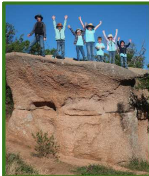
Enchanted Rock Expedition