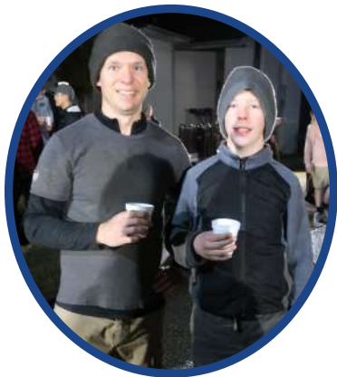
Father/Son Obstacle Race

the situation in prayer; sometimes excited, sometimes discouraged, calling on God for each new step. Recently, a law school evaluated our situation and noted that while we had a valid case it would be political more than anything else. Then a request for County records did not excite the County and they asked the Attorney General to classify the information. We are awaiting a decision on the records and rejoice in each new layer of proof and turn again to God with each new obstacle that looms ahead. If you want to learn more, visit rescuegreenleaf.com .