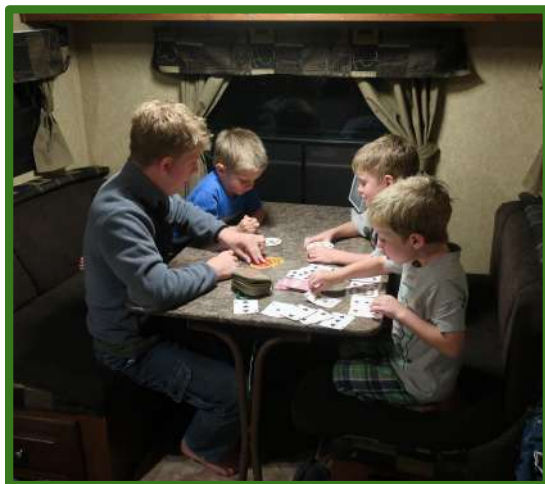
Games In The RV