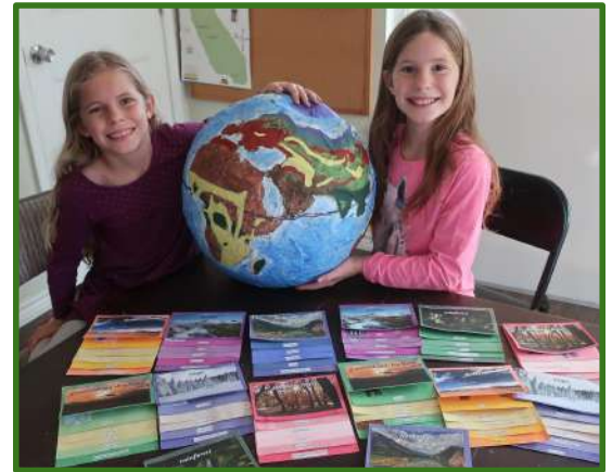
Biome Project For Earth Science