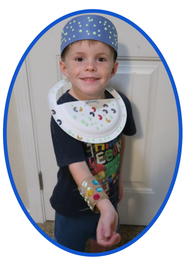
Decked out in regalia from our Egyptian study

While she struggles with everyday responsibilities and details, she has handled