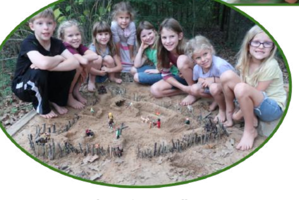
Jamestown replica: we schooled during the hot summer, working through American history