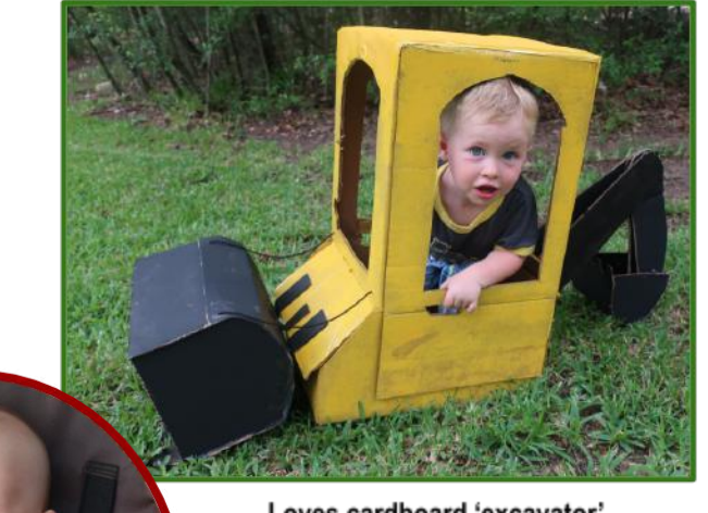
Loves cardboard 'excavator' made by mom