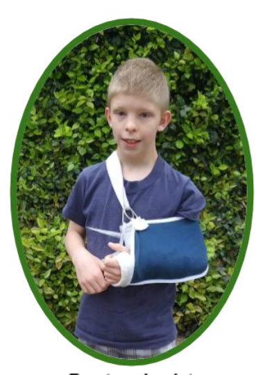
Fractured wrist winning tug-of-war