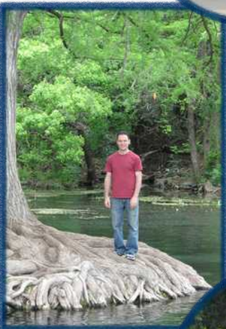
San Marcos babymoon with Flying Armadillo's disc golf

The highlight of the year was a September excursion to Colorado. Excitement mingled with trepidation as we planned our first family trip that included toddlers and infant! We accomplished our goal of spending time with relatives in Denver while navigating through gardens and parks. A beautiful day in the mountains included exploring a waterfall and discovering a river running through a rock tunnel. Despite mild car trouble, we returned from our adventure victorious and exhausted.