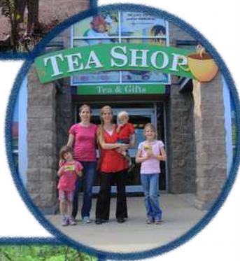
Touring in Denver

Greetings family and friends! Over the last few years we have worked hard taking dominion over a piece of property, slowly creating our homestead. Along the way we find our priorities are changing from "finishing," to rejoicing in the results that God has given to our work. From putting school on hold to get to the heart of an attitude, to stopping in the middle of a project for a game or outing, we are embracing each season of life as it comes.