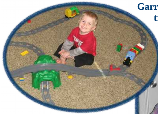
Garrison loves trains!