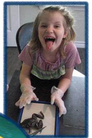
Frog dissection for science