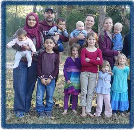
Befriended Iraqi family