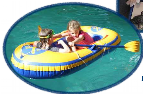
Learned ships and rowing

A time to teach, a time to learn: The Spring school term remained strong in academics with individual assignment sheets keeping everyone on track. Amy continued to host an American Girl co-op