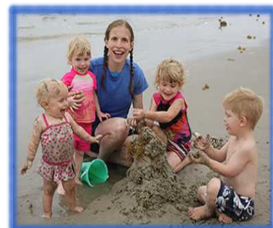
Visiting Grandpa at the beach!