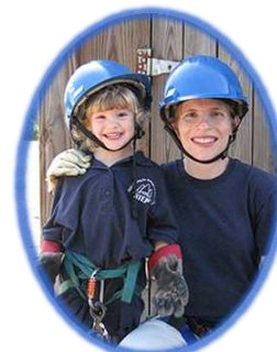
Rappelling at girls survival camp