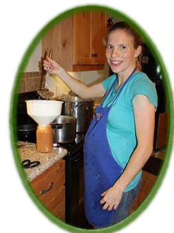
45 quarts of applesauce and 32 weeks pregnant