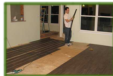
Easiest floor ever?