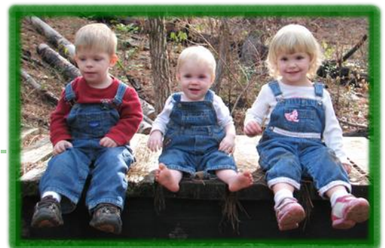
First Camping Trip