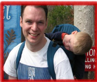
Two Dedicated Hikers

Another challenge came in the form of searching for a church home. Visiting different denominations caused us to examine and solidify our beliefs.