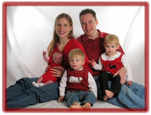
Our flourishing family

Thanksgiving day came and went with no baby but