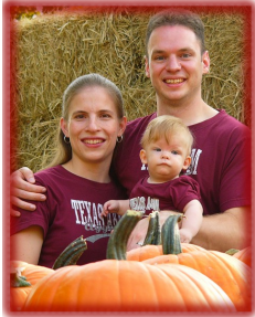
Our little family

Those that be planted in the house of the Lord shall flourish in the courts of our God. Psalms 92:13