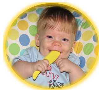
First haircut – 6 mo.