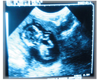
Our Little "Tadpole"

Even though our future was uncertain, we felt God's direction to start a family and were soon delighted to be expecting a child, due in March of '08! We both received our Bachelors degrees within a month of each other – time for the next stage.