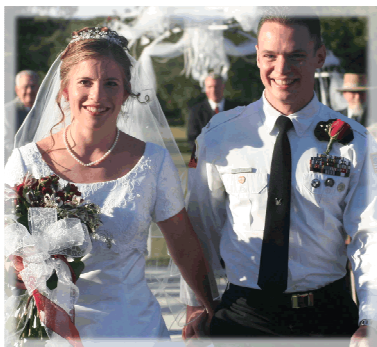
Oct. 28, 2006

Greetings from the newest Cahill family! Following the example of our parents, we are taking up the pen (or keyboard) to give an account of our life this year. We have really seen the Lord at work and would like to testify of His doings so you can praise His goodness with us.